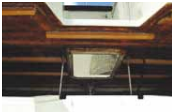
Engine lid with furring strips