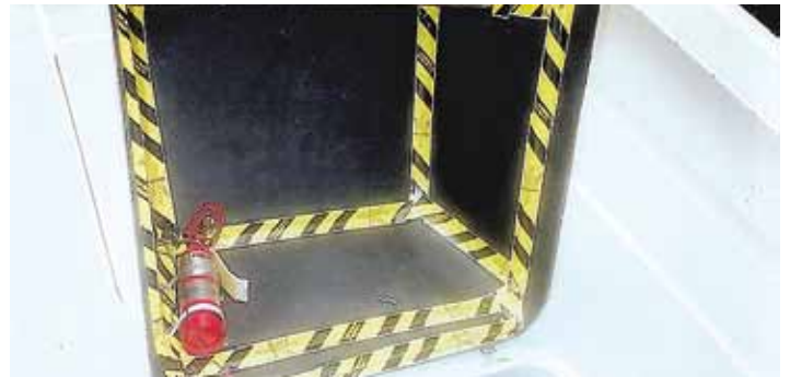
Completed engine compartment