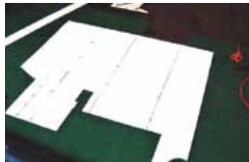
Starboard covering (template)