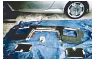
After Acoustiblok® application