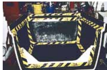
After Acoustiblok® application