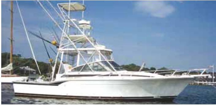
Blackfin SportFish Combi 31'

We were contacted about an engine noise issue in a Blackfin Sportfish 31. A combination of Acoustiblok® and Starboard was installed in the engine compartment lid. Customer stated "The piercing turbo whine was reduced over 30%. The Blackfin is now a greatly improved boat and is much quieter – Acoustiblok® really does work."