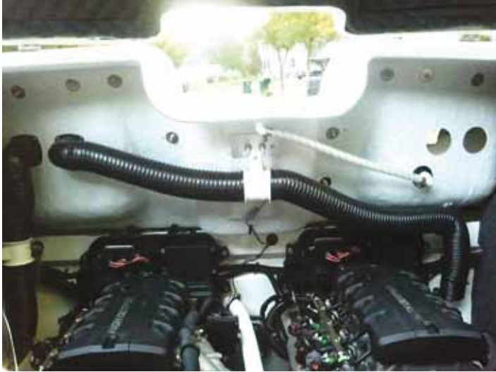
Before installing Acoustiblok®