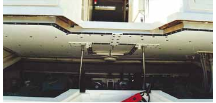
Completed engine lid