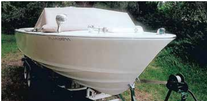
1965 Bertram boat

We were contacted to resolve an engine noise issue in a 1965 Bertram boat. Acoustiblok® was applied to the engine compartment, lid and adjacent areas. The noise reduction that resulted allowed people to have conversations on the boat while at speed on the water. The 79 years old customer has been restoring boats for many years and said that Acoustiblok® is the best sound barrier he has used.